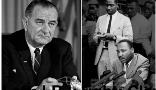
Clarence B. Jones, up, and Dr. Martin Luther King Jr., seated